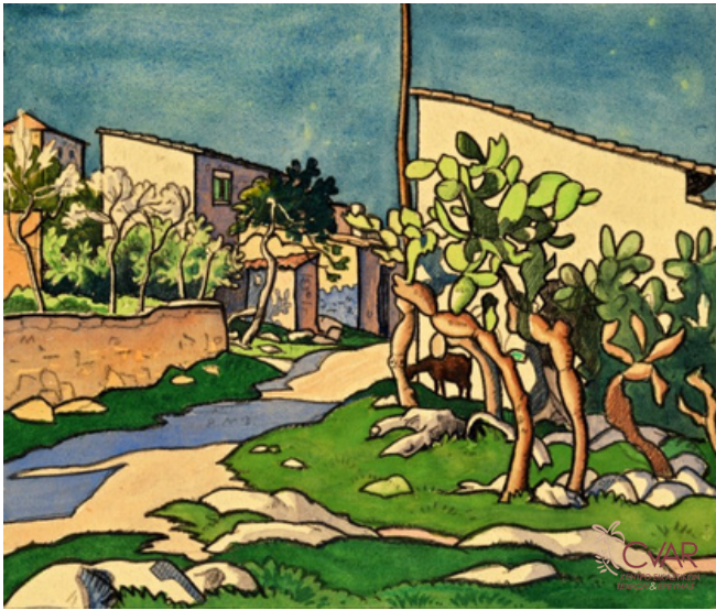
White Ethelbert, Cypriot Cactus, 1950