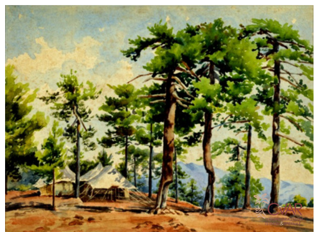
Ann Villiers, Camping in Troodos, 1900

More more inspiration you can check out the painting collection of the museum here: cvar.severis.org/en/explore/collections-archives/paintings/