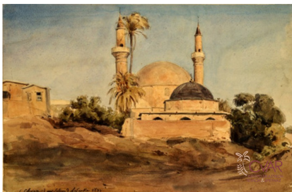
Άγνωστος, Larnaca Salt Lakes, 1837