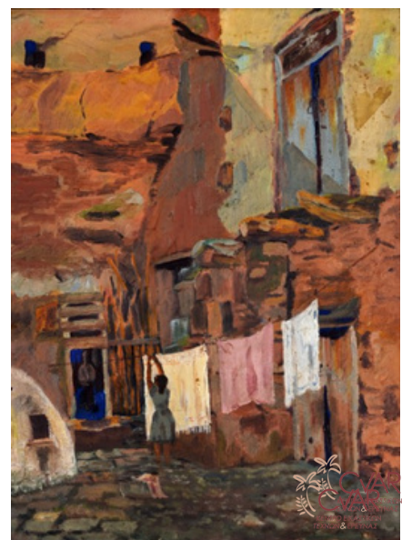
Colonel E. Pain, Village street, 1953