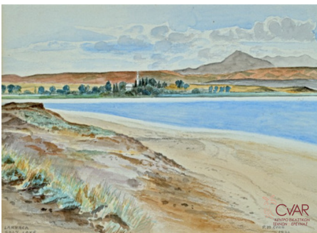
Cram, Larnaca Salt Lake, 1936