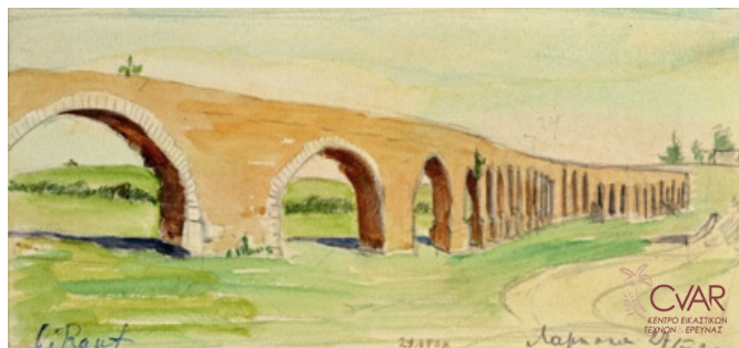
Olga Raouf, Aquadect, 1930