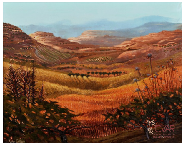
Alan Cotton, Summer landscape near Paphos, 1977